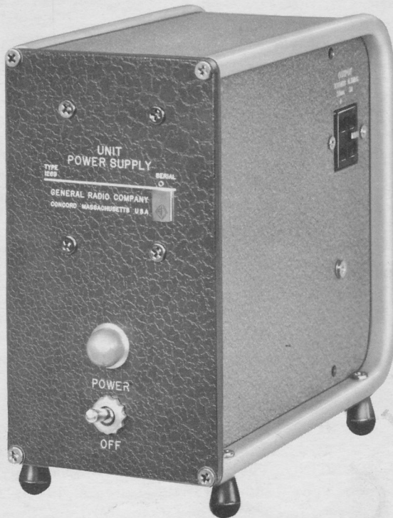
Figure 1. Type 1269-A Power Supply.